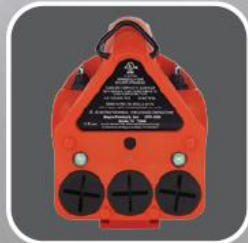
Rear-Facing Green Safety LED