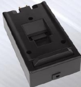
Wall or vehicle mounted charger