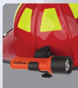
Clip Mount – Up (mounts to either side of helmet)