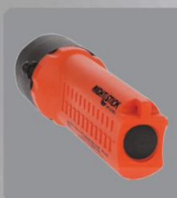
Single tail switch

cETLus, ATEX, and IECEx listed Intrinsically Safe