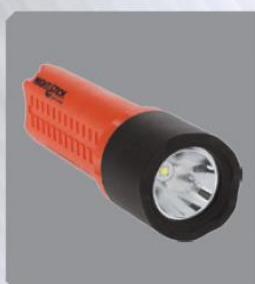
High-efficiency deep parabolic reflector