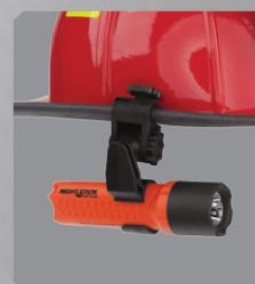
Clip Mount – Down (mounts to either side of helmet)