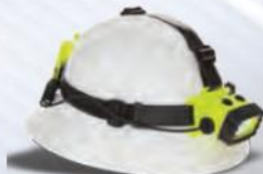
Rubber hardhat strap included