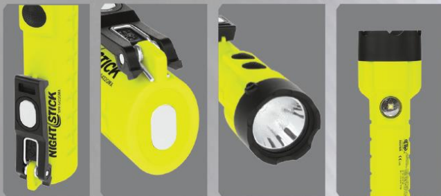
Built-in pocket/belt clip with integrated magnet