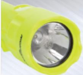
High-efficiency deep parabolic reflector