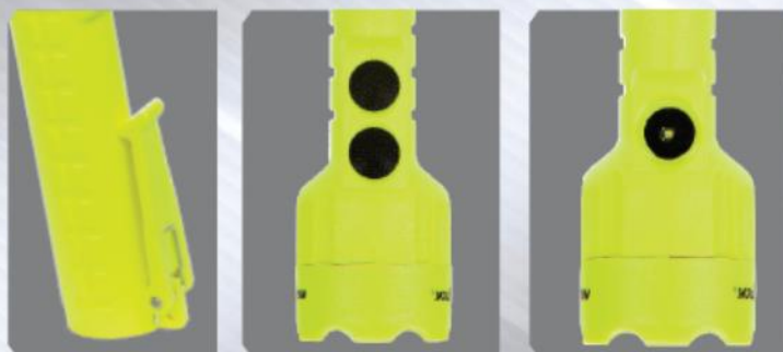
Built in pocket/belt clip